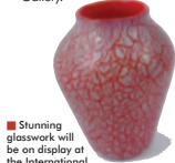
Stunning glasswork will be on display at the International Festival of Glass in August.