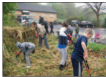
■ Above and below: Volunteers at work on the Hawbush Urban Farm sight.

Work has already seen the entire front section of the site cleared thanks to help from around 30 young volunteers from Hawbush who were part of the Brierley Hill Project. Volunteers then helped to build raised beds and food growing areas to be used by residents and school children. A wildlife area has been created around the pond along with a pond dipping platform and a seating area, with a fire pit, barbeque platform, benches, and