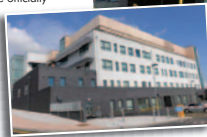
►► What a tonic: The new Brierley Hill Health and Social Care Centre.