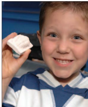
Fossil fun at Dudley Museum and Art Gallery.

18 (10am-noon) - Wildlife safari at The Leasowes. Call 01384 814642. 18 (10am-2pm) - Wildlife activity day Dudley.